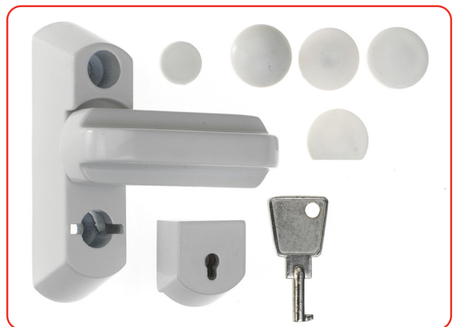
Sash Jammer with key lock